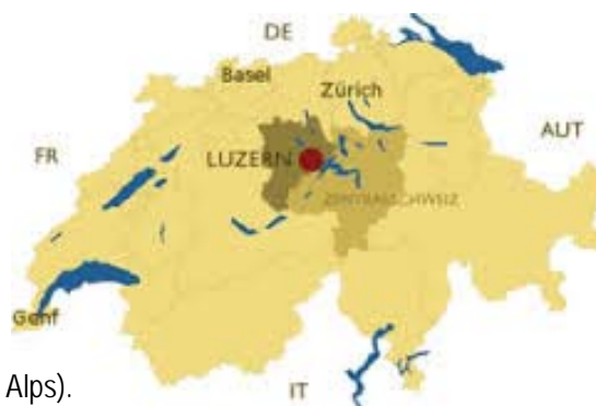
Lucerne in the heart of Switzerland

Panel on sustainability as key factor for food security. Visit Farms and processing facilities.